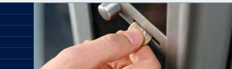
Vending & Self-Checkout machines